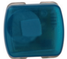
Wrist tag with tag pulse

Room-Level Locating: To know with complete certainty that a resident is in a particular room, opt for room-level locating. This solution involves the use of location marker in rooms where you wish to have location information, in conjunction with the pulse tag and receivers. This option will give you real time location, while also identifying exactly which room the resident is in.