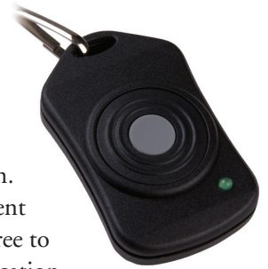
The Pendant tag

The RoamAlert system also makes it easier to locate residents in a general emergency, like a fire alarm. This can be challenging if a resident is not in their room or a common area. With RoamAlert, any resident can be quickly located using the Locate menu in the RoamAlert software. Just click down the search tree to select the resident you wish to find: an icon appears on a map of your facility showing the resident's location.